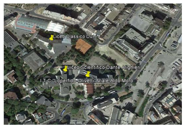
FIGURE 2. Geographical location of the second school complex

The figure 2 below shows the closed geographical location of the three school complexes.