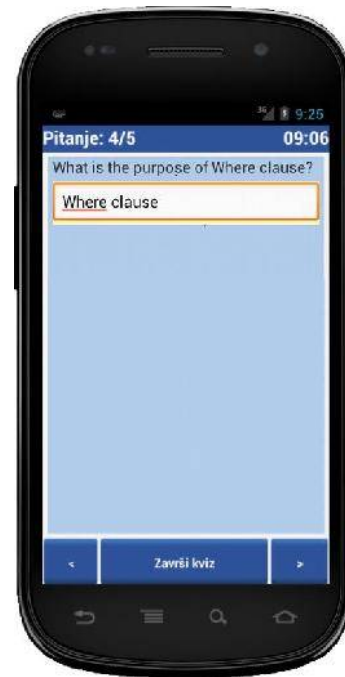
Figure 3. Example of question with short answer in MoodleQuiz application

Within this project no changes were made in user interface of Android application, so users won't notice any changes in their user experience. Most changes were made in part of the application which is executed after the attempt is finished. In original application, quiz submission included assessment of all questions in the quiz and calculation of final score. This was done based on quiz and question setup, limitations set by quiz designer, question designer and official Moodle documentation. After that, final score along with other information is sent to the server and inserted into Moodle database, so that it can be available in administration panel in Moodle system.